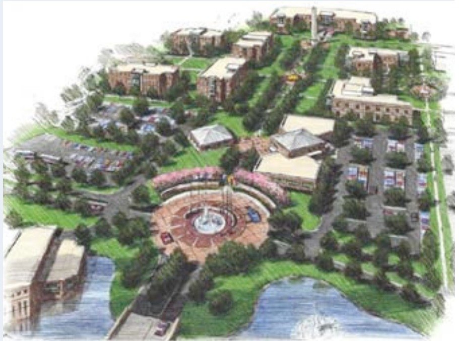
Artist illustration of proposed entrance to the Innovation Campus.

The park will be a home for expanded university research and entrepreneurship, incubation and mentoring